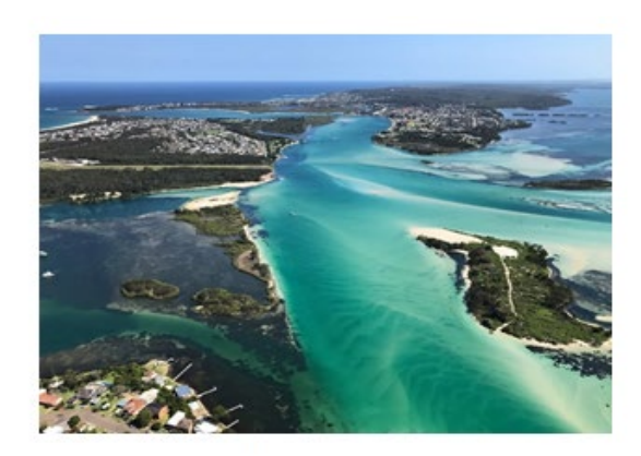
Swansea Channel, Lake Macquarie

With a wealth of local knowledge and friendly service, Lake Macquarie Visitor Information Centre exists to help visitors make the most of their stay. View accommodation and destination information online at <u>visitlakemac.com.au</u>, or freecall 1800 802 044 to order a free Lake Macquarie Visitor Guide and Map.