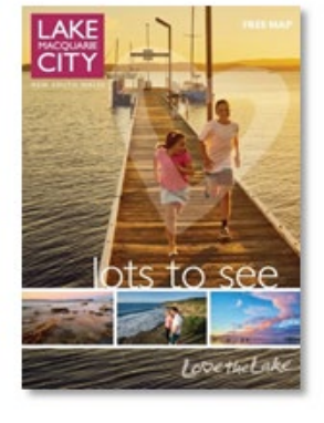
Lake Macquarie Visitor Guide and Map