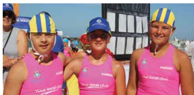
North Cronulla age competitors at the 2018 NSW Surf Life Saving Championships