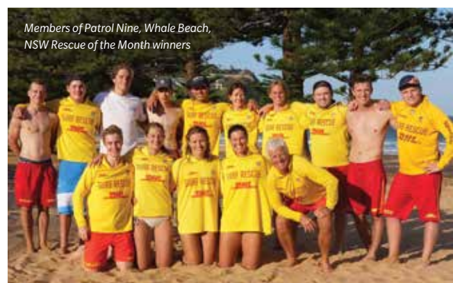
Members of Patrol Nine, Whale Beach, NSW Rescue of the Month winners