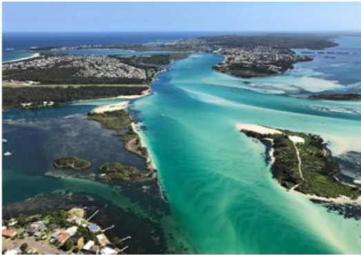
Swansea Channel, Lake Macquarie

With a wealth of local knowledge and friendly service, Lake Macquarie Visitor Information Centre exists to help visitors make the most of their stay. View accommodation and destination information online at visitlakemac.com.au or freecall 1800 802 044 to order a free Lake Macquarie Visitor Guide and Map.