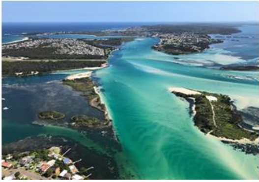
Swansea Channel, Lake Macquarie