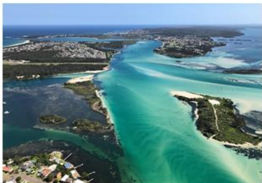
Swansea Channel, Lake Macquarie

With a wealth of local knowledge and friendly service, Lake Macquarie Visitor Information Centre exists to help visitors make the most of their stay. View accommodation and destination information online at visitlakemac.com.au or free call 1800 802 044 to order a free Lake Macquarie Visitor Guide and Map.