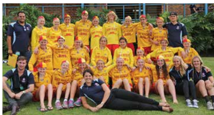
Junior Lifesaver of the Year Finalists and Facilitators 2014

Surf Life Saving NSW congratulates all those selected for these exciting development opportunities.