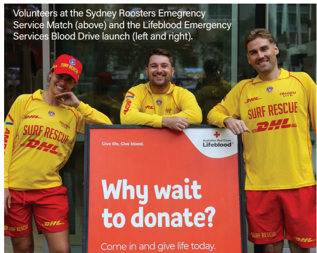
Volunteers at the Sydney Roosters Emergency Service Match (above) and the Lifeblood Emergency Services Blood Drive launch (left and right).